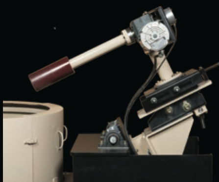
Head Up Load Position