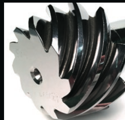
Part After Process