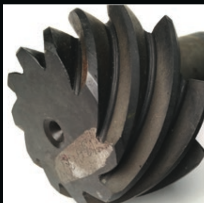
Part Before Process

This is a very small sample of where Versa-Flow Spin-Finish can be used for solving finishing problems.