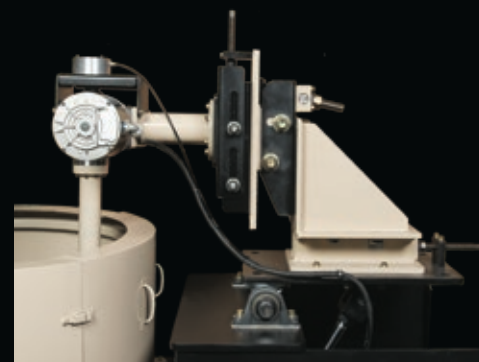
Head Down Process Position