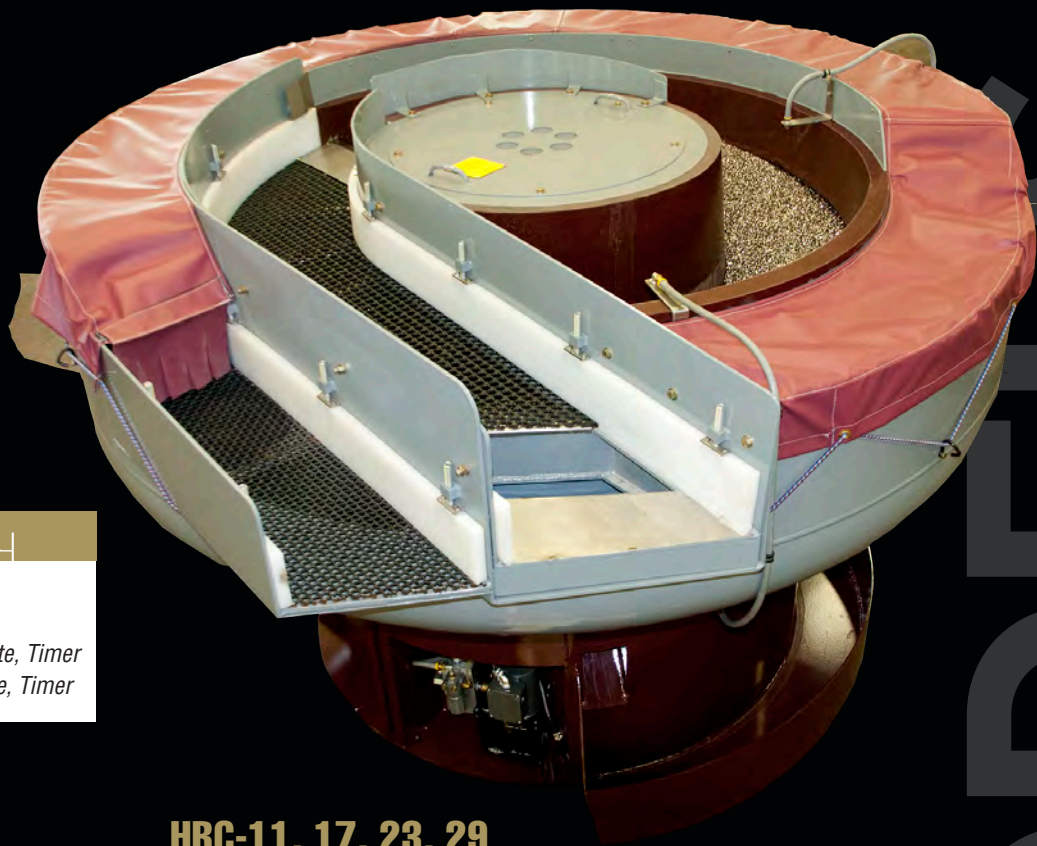
HRC-11 Shown with optional Dust Cover